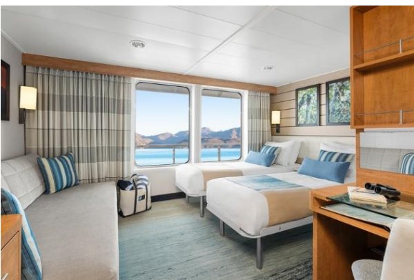
CATEGORY 5 Suite – Observation Deck