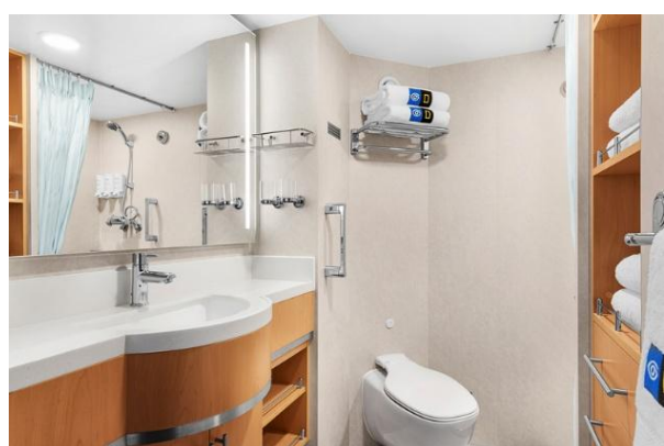
CATEGORY 5 Suite - larger Bathroom (Not the same for cats 1-4)