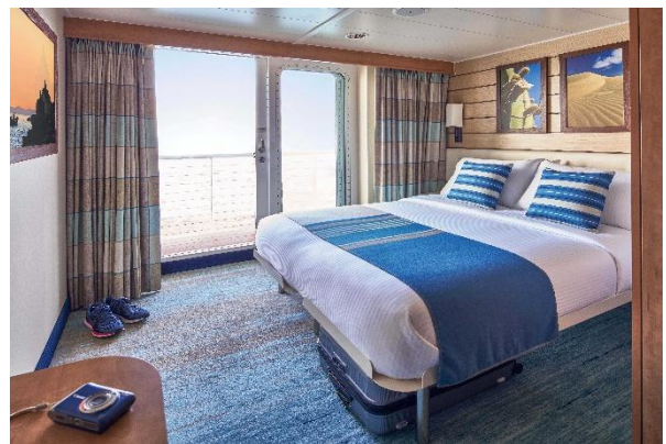
CATEGORY 4 - Upper Deck w small balcony