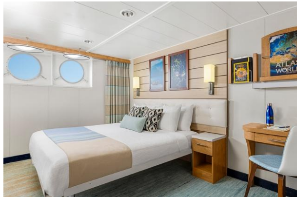
CATEGORY 2 - Main Deck