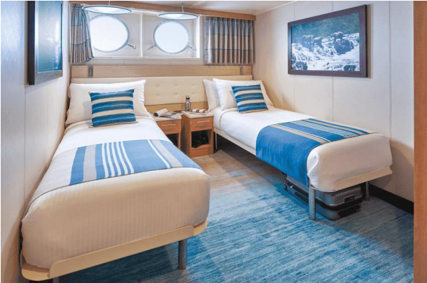
CATEGORY 1 – Main Deck