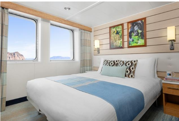
CATEGORY 3 – Upper Deck