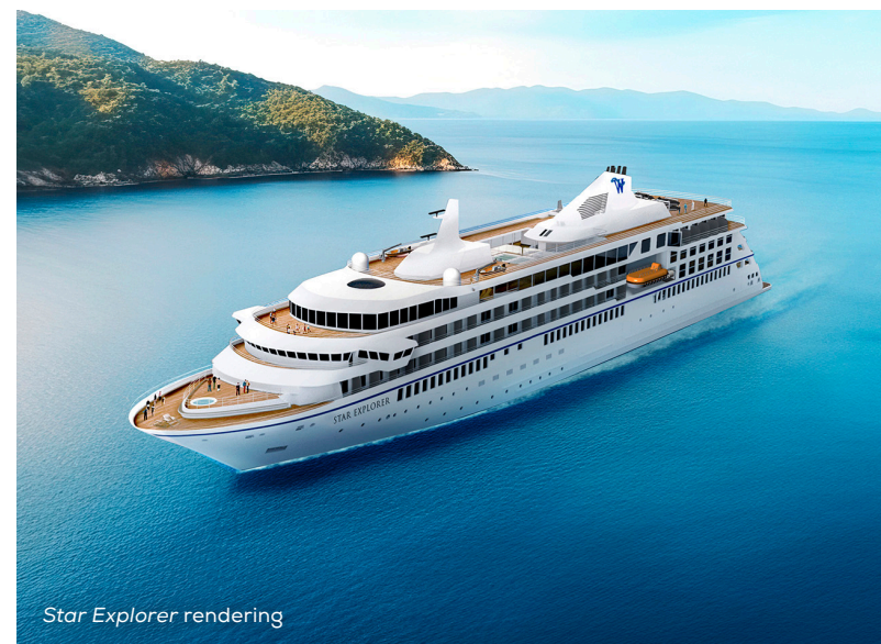
Star Explorer rendering

Access to board ship is via stairs only. Access to/from outside deck may require assistance with doors and thresholds.