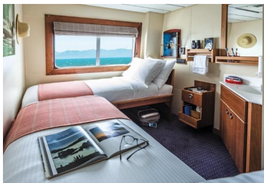
CATEGORY 1 - 2 fixed singles – Main Deck