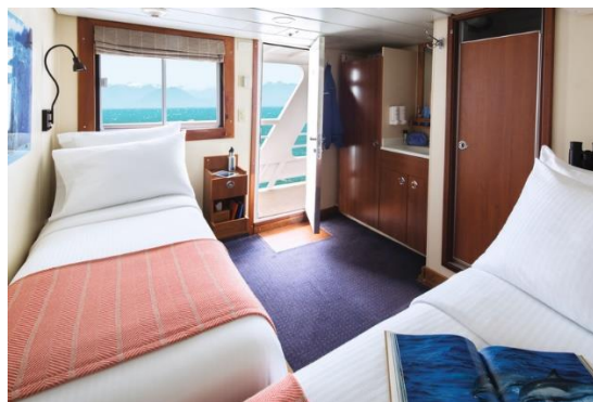
CATEGORY 2 - 2 fixed singles – Upper/Bridge Decks