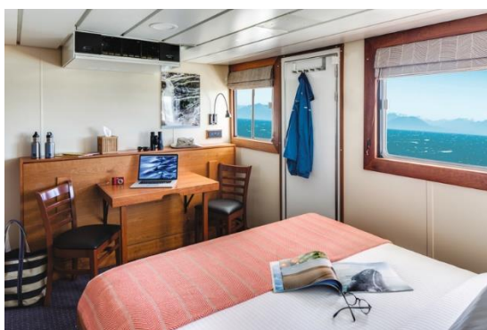
CATEGORY 3 – 1 double bed – Upper Deck

CAPACITY: 62 guests in 31 outside cabins.