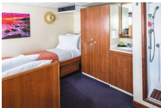
CATEGORY 3 – 2 fixed singles – Bridge Deck