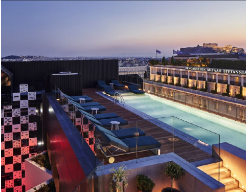
Athens Capital Center Hotel—MGallery