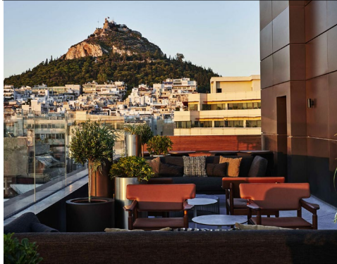
Mappemonde Restaurant Bar & Lounge