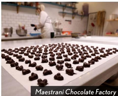
Maestrani Chocolate Factory