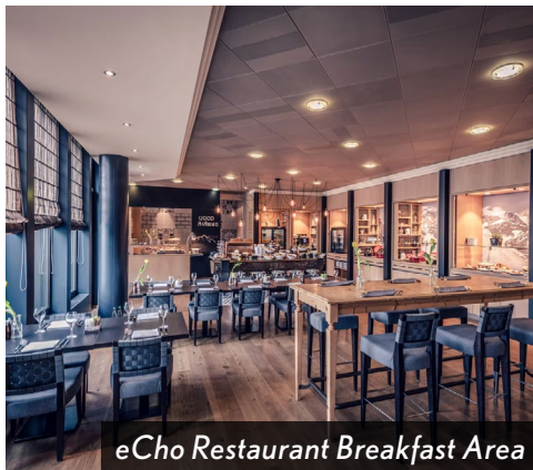
eCho Restaurant Breakfast Area