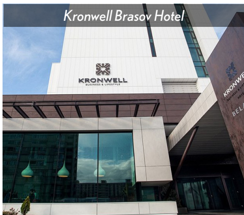
Kronwell Brasov Hotel