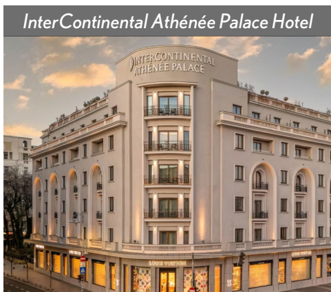
InterContinental Athénée Palace Hotel

Located in the heart of Transylvania, their dedicated and hospitable staff ensure that every detail of your stay is impeccable. Recognized with First Prize for Hotel of the Year in the Independent Hotels 4 Star category for 2025 and Traveler's Choice No. 1 on TripAdvisor for 2024 , Kronwell is committed to providing an exceptional experience surrounded by remarkable views and breathtaking landscapes. You'll discover first-class amenities, impeccable service, and refined style.