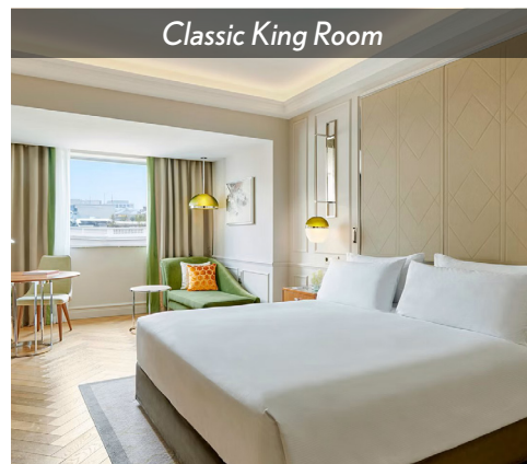
Classic King Room